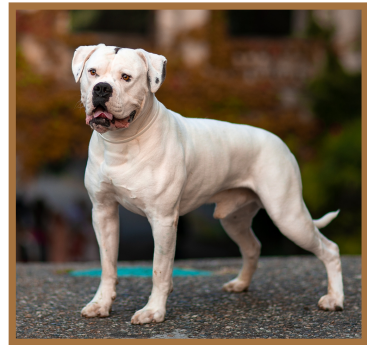
Bulldog (all kinds)